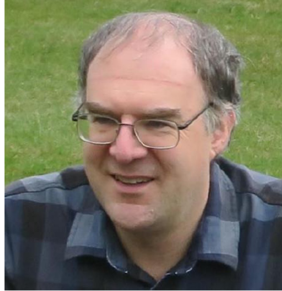
Tim Hunt, Open University UK